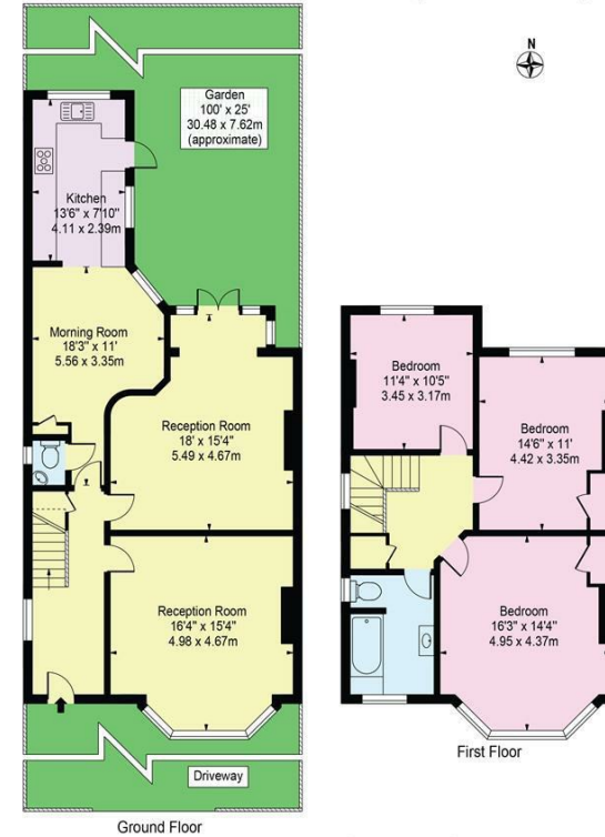
Ground Floor For Illustration Purposes Only - Not To Scale

Ulleswater Road Approx. Gross Internal Area 1532 Sq Ft - 142.33 Sq M